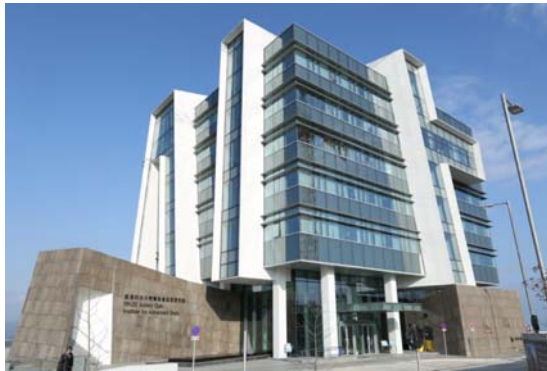
IAS Building @ HKUST

The conference will be held in the brand new conference facility of the Hong Kong University of Science and Technology Jockey Club Institute for Advanced Study (IAS) (香港科技大學賽馬會高等研究院).